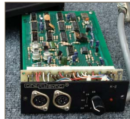
A Cine-Sync K-2 to link KEM editing machines. Denecke made and sold about 400 of these boxes.